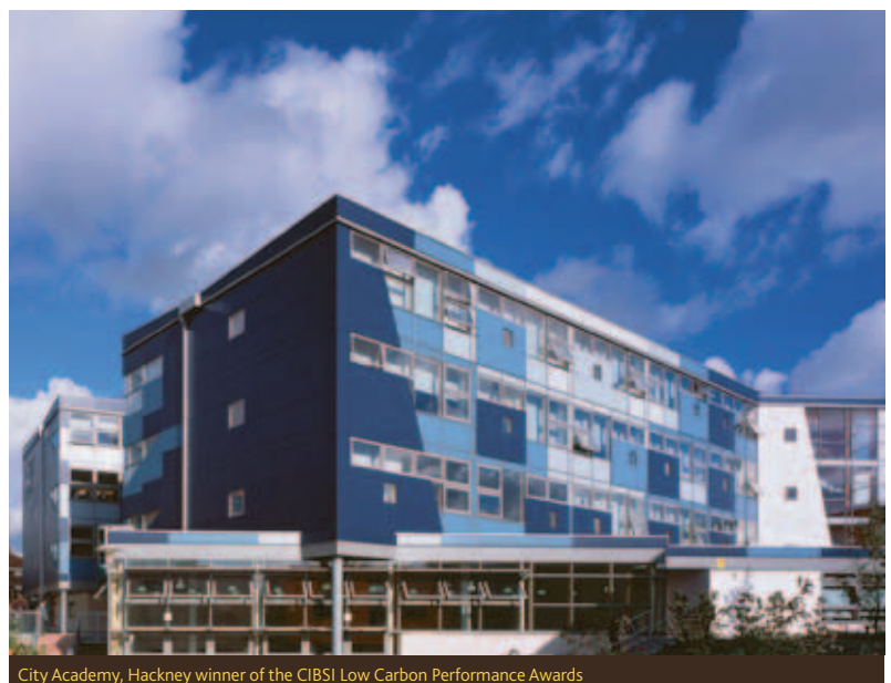
City Academy, Hackney winner of the CIBSI Low Carbon Performance Awards

www.willmottdixongroup.co.uk/sustainability/energy-and-climate-change