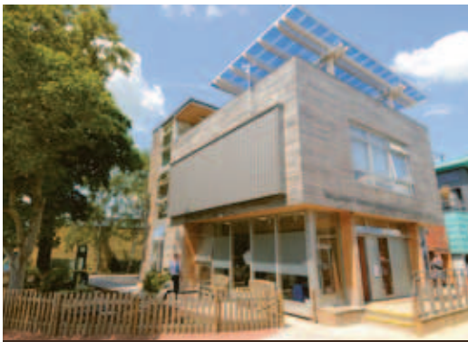
Community Healthcare Centre at the BRE Innovation site

Re-Thinking's activities are structured around Willmott Dixon Group's four sustainable development themes