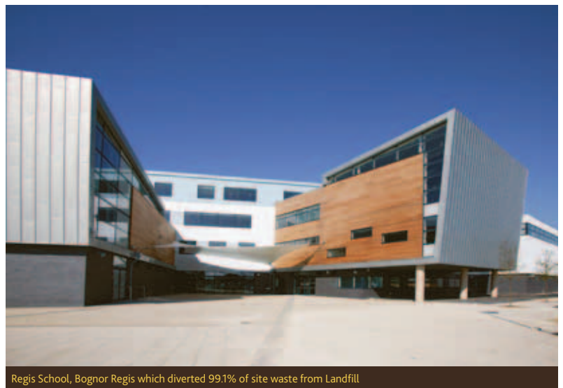
Regis School, Bognor Regis which diverted 99.1% of site waste from Landfill

www.willmottdixongroup.co.uk/sustainability/natural-resources