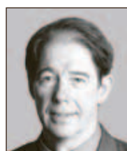
JONATHON PORRITT DIRECTOR